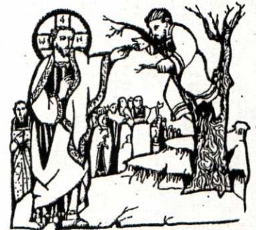
blessing of candles